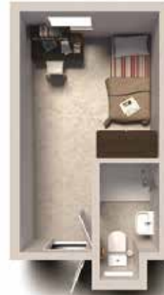
Single bedroom en-suite (13.61 m 2 )