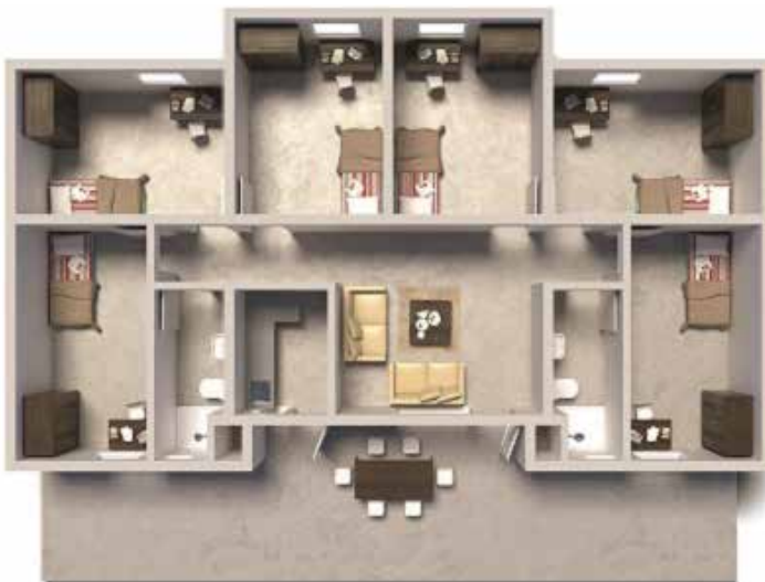
Single bedrooms in shared apartments (11.20 m 2 )

The illustrations and specifications are only indicative and non-contractual.