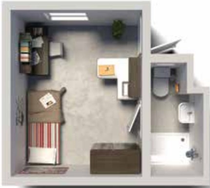
Studio flats (14.25 m 2 )